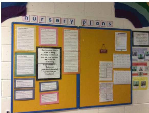
Nursery Planning Wall

We have introduced online learning journals for assessment of your child. You will be signed up and can access them to see photos of your child at any time.