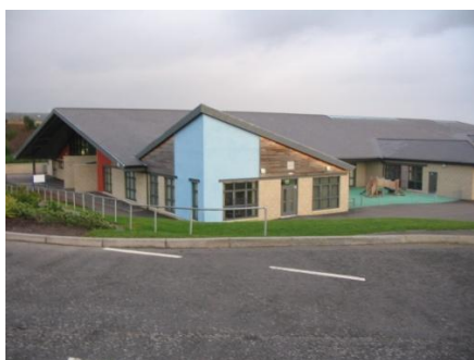
The school from the front of the new part of the building

The Parent Council also helps to organise fun events for the children such as the regular Discos, and the leaving gift for pupils at the end of Primary 7. There are also a number of community- based fund raising events that the members organise. Do join them if you can!